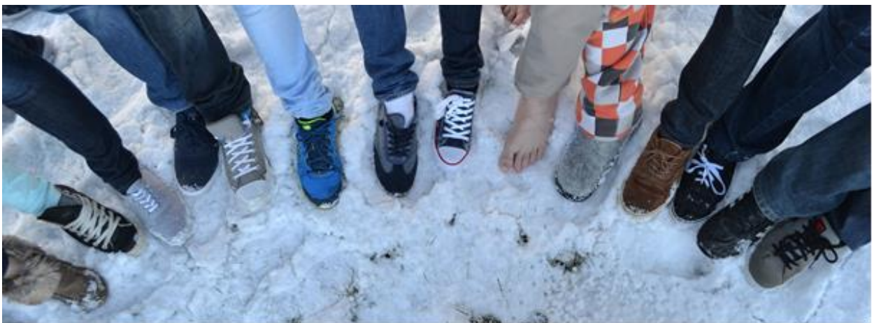
Diversity in the Arctic